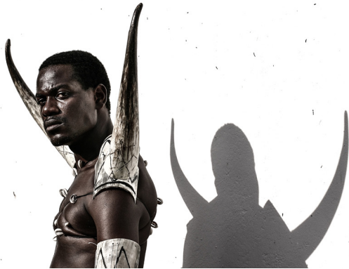
Figure 1. Body Ornamentation photo shoot, UMU. (© Nina Hamilton)

around themes including: Dynastic Tombs; Grand Gardens; Places of Pilgrimage, and; Sculpture and Ornament. This allowed for exploration of sites from across the world, enabling the comparison of design drivers, as well as the social, cultural, and environmental considerations that scaffold these projects. It also avoided a single narrative approach often taken in the study of architectural history. Sites in Africa such as Meroe, Nubia (300BCE – 450CE); the Great Mosque at Djenné (13th century CE), and; Kasubi Tombs, Buganda (1890CE+) were thus explored, alongside similar themed sites, such as the Temple of the Warriors at Chichén Itzá, Mexico (7th-13th centuries CE), Chartres Cathedral, Chartres, France, (1194-1220CE), or the Tomb of the Ming Dynasty, Hebei Province, China (1409CE+). This was critical in presenting African historical sites as part of architectural discourse, despite these being absent in mainstream architectural history. Such explorations served to validate student's histories, providing a basis for active participation in discussions that included their traditions and cultural practices as part of architectural discourse.