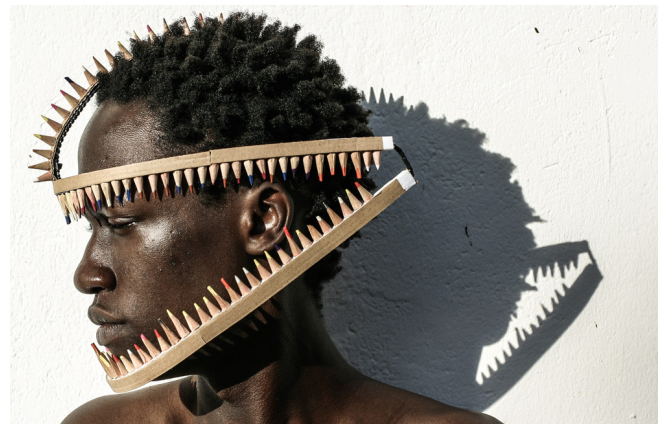
Figure 2. Body Ornamentation photo shoot, UMU.

While on the surface, both Design Fundamentals and Culture, Climate and Settlements had expressly different agenda with relation to the explicit curriculum, underlying these was the need to ensure instructors listened to students. The Body Ornamentation project proved particularly emotional as it brought out personal stories and deeply held convictions that could then be appropriately interrogated. By designing and making wearable ornaments, students were also made aware of the narratives behind artifacts used in different settings, and began to appreciate their value beyond mere decoration. Carrying this through to architecture, the assignment Reflections of the Past as undertaken in the course Culture, Climate and Settlements allowed students to study architectural endeavors from an advantageous position, one that related to them, and not alien notions of what constituted 'real' architecture. This allowed instructors to draw out expressive ideas while developing rapport with students, through the individual recitals, which were useful in assuring students that their ideas were indeed valued, bringing forth stories that in some cases