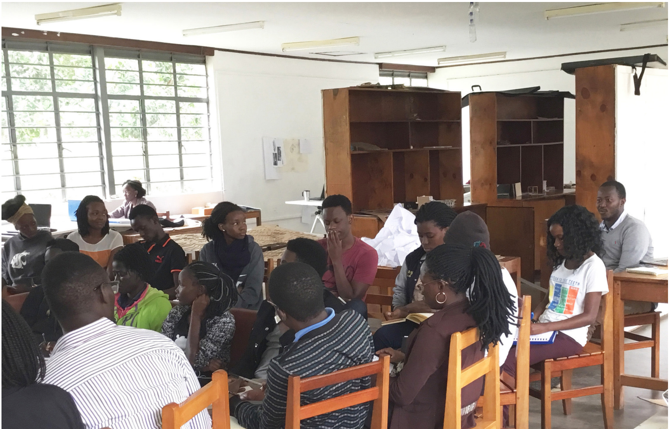
Figure 3. Back Seat Instructor session, UMU.

various journeys undertaken were key to exposing students to creative traditions and practices that are often difficult to bring into a classroom setting. Both these activities were important in bridging tradition with contemporary culture as part of architectural education at the Uganda Martyrs University.